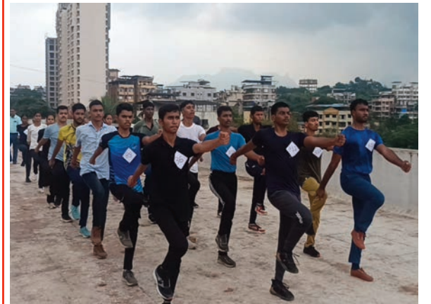
NSS volunteers participating in the Pre-Republic Day (Pre-RD) selection process conducted at the college campus.

As part of its ongoing efforts to encourage leadership and discipline among students, the college conducted the NSS Pre-Republic Day (Pre-RD) selection process on campus. The activity provided NSS volunteers with an opportunity to showcase their commitment, physical fitness and readiness for higher-level participation.