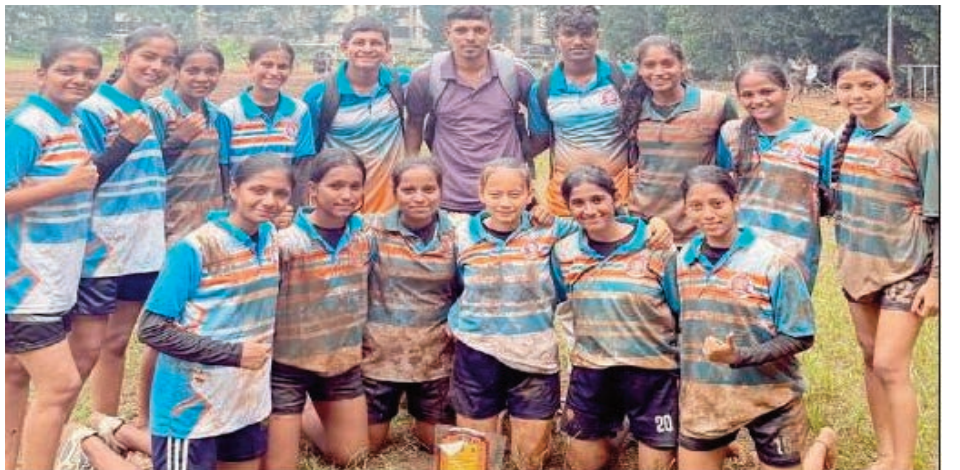
SST college women's team pose with felicitation trophy at the district-level rugby competition.

In the Ulhasnagar Municipal District Level Rugby Competition organized at Century Rayon School, Shahad, players from SST College performed brilliantly in both the under-19 boys and girls categories and secured first place. This remarkable success adds another golden page to the college's sports tradition.