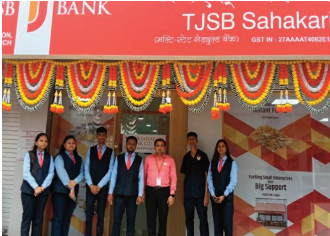
BMS students posing with bank officials during their educational visit to TJSB Bank, Badlapur.

With the aim of familiarising students with real-world banking practices, various departments of the college regularly organise educational visits. As part of this initiative, the BMS Department recently arranged an industrial visit for students to TJSB Bank, Badlapur.