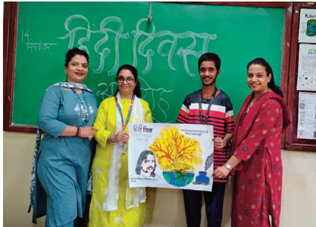
A student showcases his painting during the Hindi Diwas celebrations at SST College, accompanied by faculty members.

STUDENTS PARTICIPATE IN DEBATES, POSTER MAKING AND DRAMA TO PROMOTE HINDI