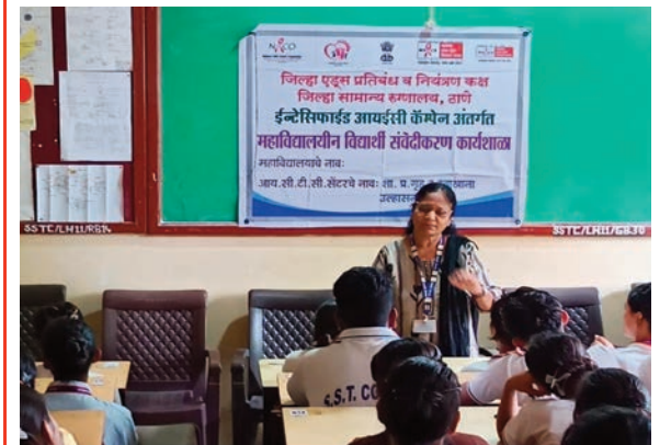
NSS and Women Development Cell students with government hospital officials during hygiene and AIDS awareness drive at SST College.

NSS Unit of SST College, in collaboration with the Women Development Cell, recently conducted a hygiene drive and an AIDS awareness program on campus. As part of the initiative, volunteers distributed sanitary products such as gel pads and sanitary pads to students, promoting personal hygiene and health awareness.