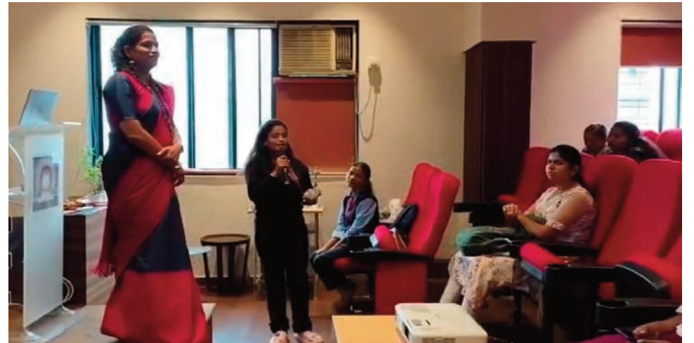
(Left) WDC Convener, Vice Principals, Department Coordinator and Cultural Head at the Women Development Cell orientation; (Right) a student shares her experience of being part of Women Development Cell.

B aruni - The Women Development Cell (WDC) of Baruni College organized an orientation session to introduce female students to its objectives, achievements, and planned activities for the academic year. The session received a positive response, with students showing enthusiasm and commitment towards active participation in upcoming initiatives.