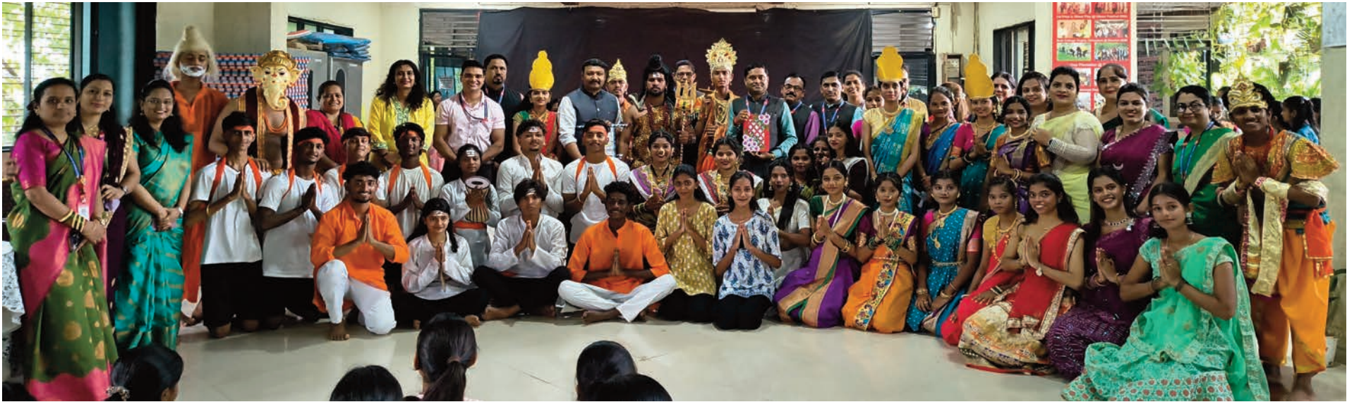
Students, faculty, and dignitaries pose for a group photograph following the Deepotsav celebrations at SST College, Ulhasnagar.

To mark the beginning of the sacred month of Shravan, SST College organized Deepotsav, a celebration that beautifully blended light, culture, and tradition. The college campus glowed with the radiance of oil lamps, while the chanting of "Tamso Ma Jyotirgamaya" (Lead me