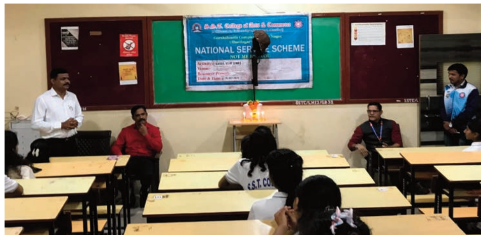
Students and NSS members pay tribute to martyrs during the Kargil Vijay Diwas commemoration at the college.

NSS Unit of the college commemorated Kargil Vijay Diwas, paying tribute to the brave soldiers who sacrificed their lives during the Kargil War.