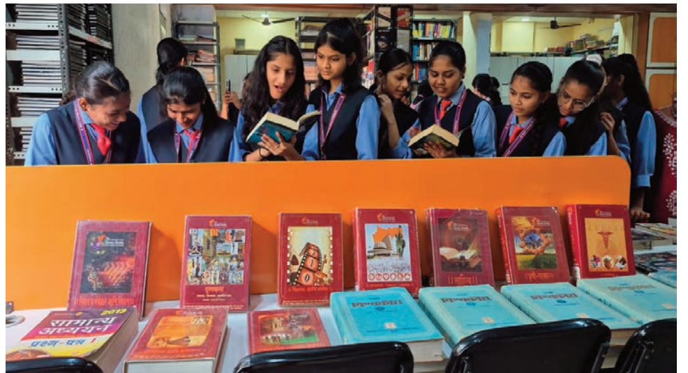
Students explore and read diverse books at SST College's Book Exhibition, promoting a strong reading culture.

Upholding the belief that "Books are the ultimate teachers," SST College of Arts and Commerce organized an enriching Book Exhibition at its library, offering students a unique opportunity to explore a vast collection of literary works and gain deeper insights into Indian and Maharashtrian culture and traditions.