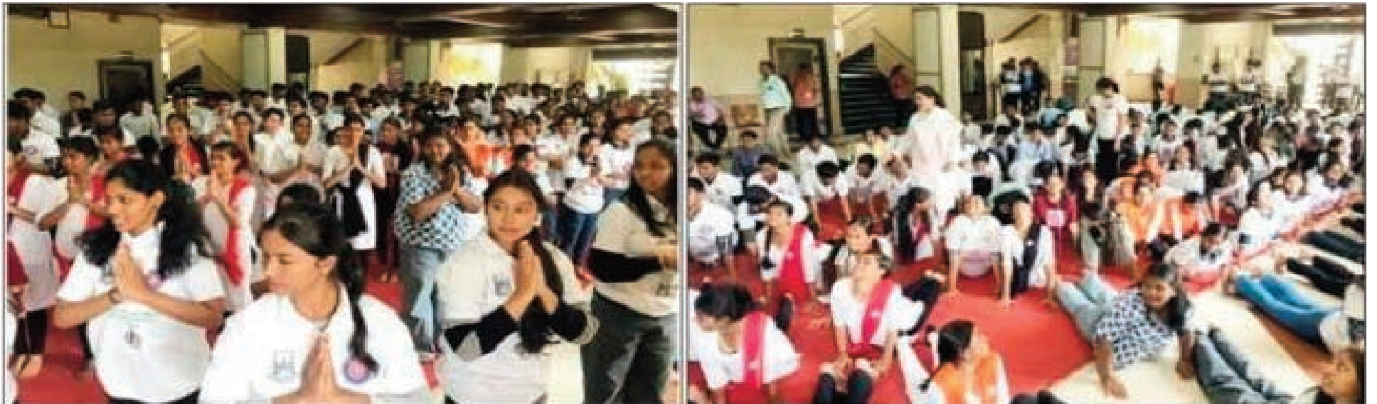
Participants performing Surya Namaskar at the grand finale of the initiative at SST College.

Under the "Developed India" and "Healthy India" initiatives of the Ministry of AYUSH, Government of India, the Mumbai University National Service Scheme (NSS) Cell, along with the NSS Unit of SST College, Aarogya Yoga and Naturopathy Center Badlapur, and Jeevan Foundation, jointly organized the "Laksh-Laksh Surya Namaskar" program with great enthusiasm.