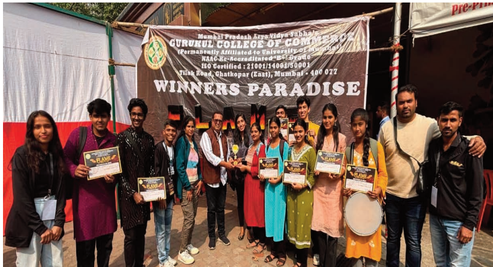
SST College's 'Dramanomics' Team Celebrates Victory After Winning First Place in the Intercollegiate Street Play Competition at 'Flame' Festival.

S ST College's cultural team, Dramanomics, brought pride to their institution by securing first place in the prestigious street play competition at the Flame festival, hosted by Gurukul College, Ghatkopar, Mumbai. Competing against 11 other colleges, the team captivated both the audience and judges with their powerful performance on the socially relevant theme of HIV-AIDS awareness.