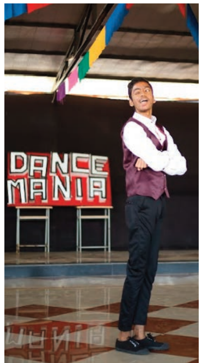
SST College Bustles with Energy as Students Battle for Glory at 'Goonj' and 'Jigar'.

I ntercollegiate competitions add a special charm to college life, and students eagerly anticipate SST College's annual cultural fest, 'Goonj.' This year, the college's 'Sanjeevani Cultural Department' organized the state-level intercollegiate cultural festival with great enthusiasm on the college premises. The festival featured an array of competitions, including solo dance, group dance, solo singing, group singing, mono act, mime, skit, story writing, mehendi, elocution, rangoli, nail art, poster making, caricature, hairstyling, photography,