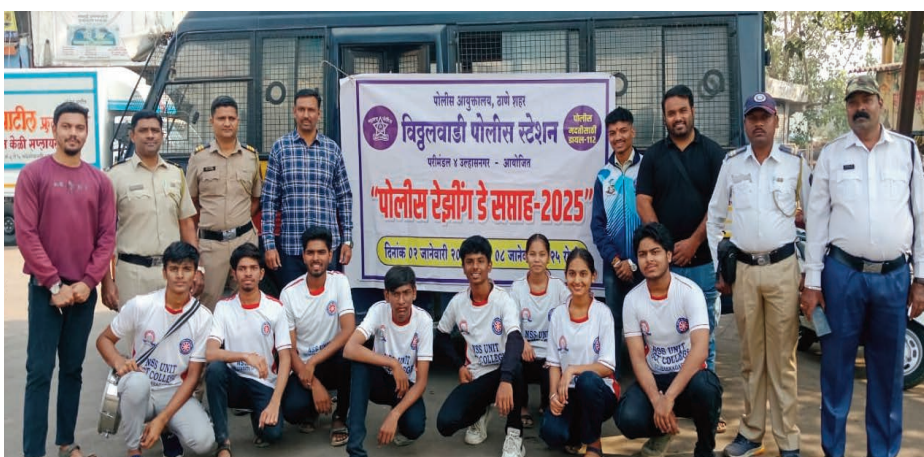
NSS volunteers along with police officials during the Police Raising Day awareness event.

As part of the Road Safety Campaign and Police Raising Day Awareness Week, the NSS Unit of [College Name] actively participated in spreading awareness about road safety through a street play (pathnatya) performance.