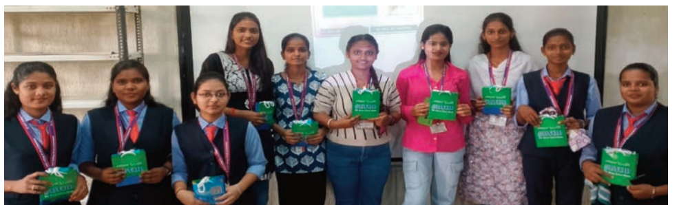
Students pose with gift hampers after the personality development seminar.

Lakshya Training and Placement Cell, in association with Y Connect, organized a seminar on personality development to equip students with essential professional skills.