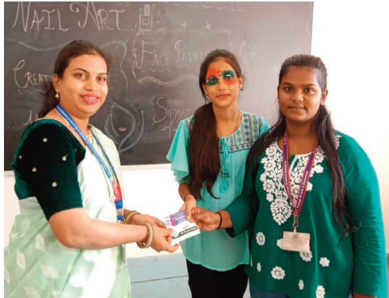
Students of SST College being felicitated with certificates by the organizing team of 'Aavahan' Intercollegiate Cultural Fest in recognition of their outstanding performances.

SST College's 'Sanjivani' Cultural Department delivered an outstanding performance at the 'Aavahan' Intercollegiate Competition, organized by J.K. College, Ghansoli, securing top positions across multiple categories.