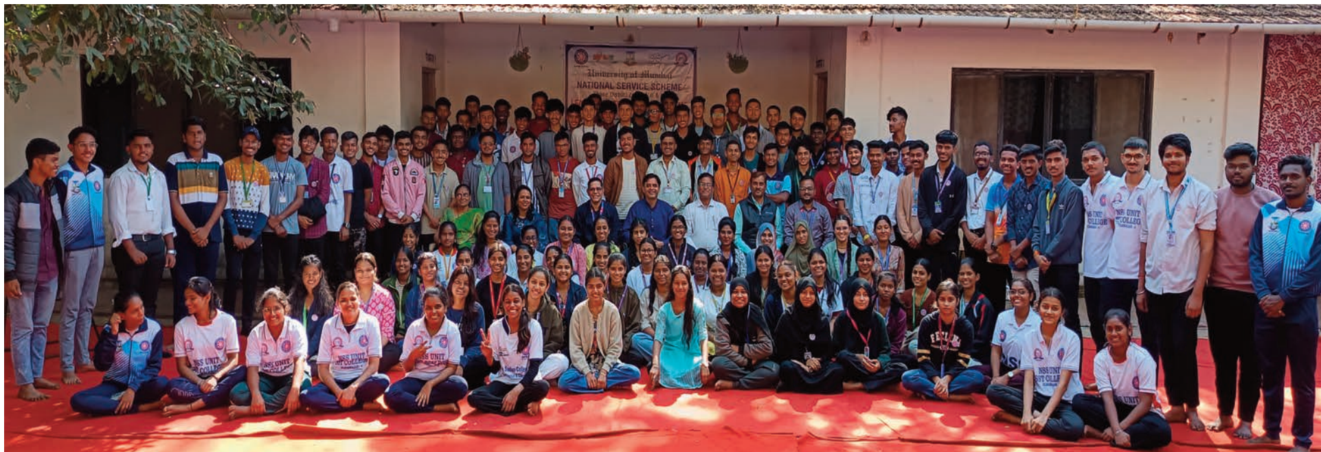
Volunteers from 89 Colleges, Along with SST College Representatives and Mumbai University Officials, Come Together at the NSS Leadership Training Camp.

A five-day leadership training camp was organized by the National Service Scheme (NSS) unit of SST College in collaboration with the Mumbai University National Service Scheme Department at Arogya Yoga and Naturopathy Center, Jambilghar, Badlapur.