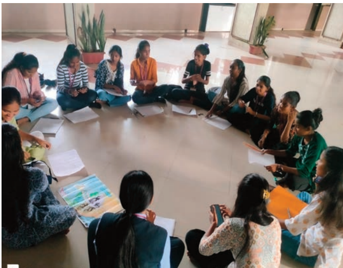
SST College students showcase their creativity and commitment to water conservation through impactful artwork at the Green Club's Poster Making Competition.

In an effort to raise awareness about water conservation, SST College's Green Club organized a Poster Making Competition, encouraging students to express their creativity while promoting an important environmental cause.