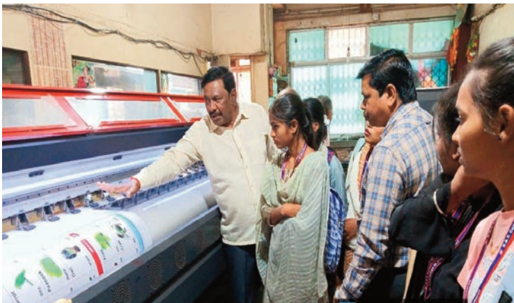
BAMMC students of SST College along with faculty member during their educational visit to the printing press, gaining first-hand insights into offset and banner printing processes.

Students of the Bachelor of Arts in Multimedia and Mass Communication (BAMMC) Department at SST College recently visited various printing presses to gain practical exposure to the printing industry. The visit provided them with firsthand knowledge of printing techniques, an essential aspect of the media field.