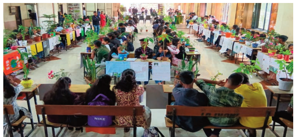
Students explore diverse tree species at SST College's 'Nature's Marvels' Tree Exhibition, promoting environmental awareness and sustainability.

SST College's Green Club organized a Tree Exhibition titled "Nature's Marvels" to raise environmental awareness. Students explored various tree species, learning about their ecological importance and role in sustainability.