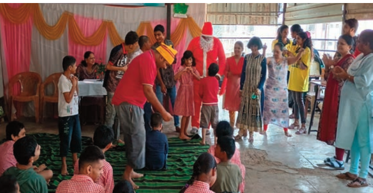
DLL&E students of SST College celebrating Christmas at Vikas Vidyalaya, spreading joy with Santa Claus, fun activities, and gift distribution among the children.

Continuing its efforts to instill social responsibility among students, the Department of Lifelong Learning and Extension (DLL&E) Unit of SST College celebrated Christmas with the children of Vikas Vidyalaya. After the success of their Diwali celebration at an orphanage, the unit extended its festive spirit to bring joy and happiness to underprivileged children.