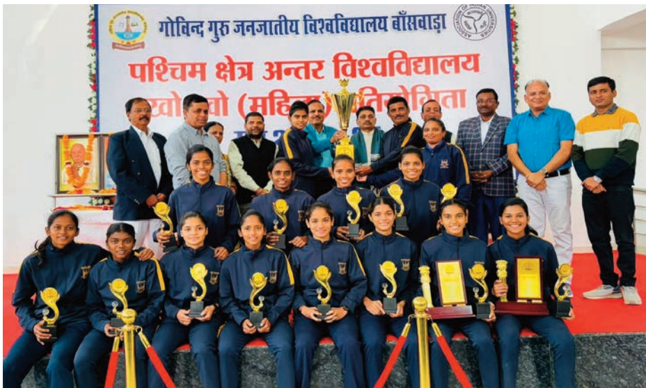
Mumbai University's women's Kho Kho team celebrates their victory at the West Zone Inter-University Tournament in Rajasthan, securing qualification for the All India University Kho Kho Championship. SST College players, felicitated with trophies and medals, played a key role in the team's success.

University of Mumbai's women's Kho Kho team emerged victorious in the West Zone Inter-University Kho Kho Tournament held in Rajasthan, securing their place in the prestigious All India University Kho Kho Tournament.