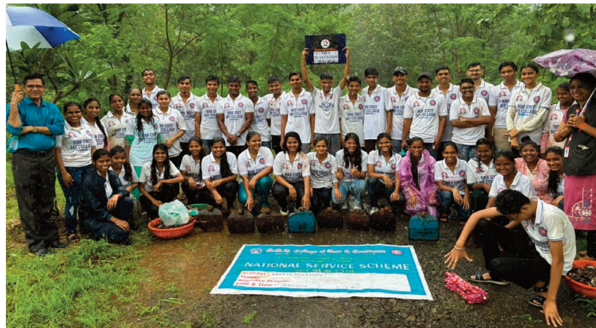
Students and faculty of SST College come together to plant trees, honoring mothers and promoting sustainability at the tree plantation event.