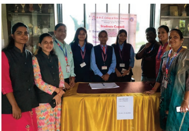
Staff and Student Council Members Pictured Together Following the PAN Card Camp Event

S tudent Council recently organized a PAN Card Camp, providing students with a convenient opportunity to apply for new PAN cards or update their existing ones.