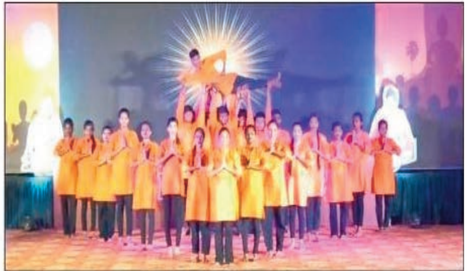
Students showcase their talent with vibrant performances during SST College's Gurupurnima celebration.

S ST College continued its longstanding tradition of celebrating Gurupurnima Utsav with a grand event held at the Town Hall in Ulhasnagar-3. The highlight of this year's celebration was the felicitation of outstanding students, an occasion that brought immense joy as their parents joined in honoring their achievements.