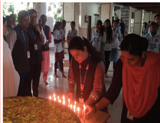
Staff Members Lighting Candles to Honor the Sacrifice of Kargil Heroes

S ST College marked Kargil Vijay Diwas with respect and patriotism. The event, organized by the NSS Unit, was held on the college campus to honor the brave soldiers who sacrificed their lives for the nation.