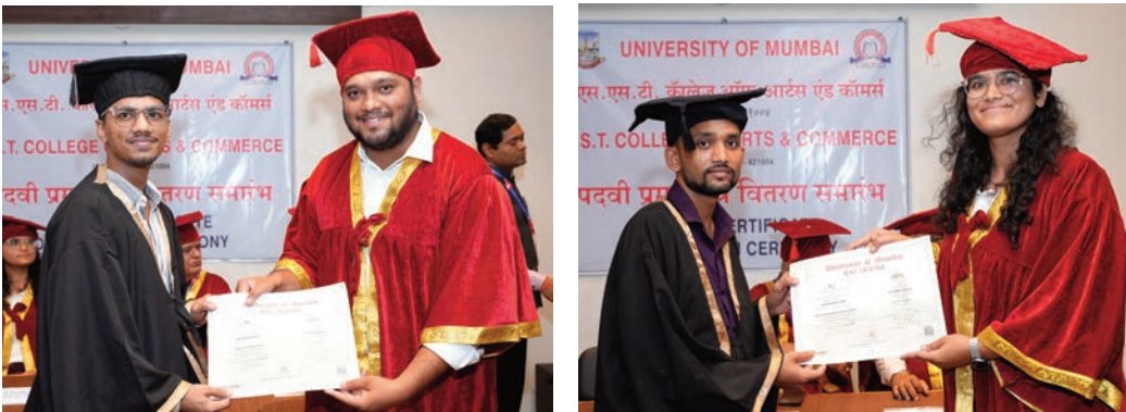
Dignitaries honor SST College graduates for their academic achievements.

The convocation ceremony is a milestone in every student's life, and SST College ensured it became a cherished memory for its graduates by hosting a grand Degree Certificate Distribution Ceremony.