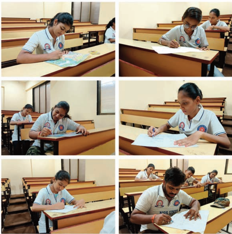
Students participate in the 'Poster Making' competition, spreading awareness on environmental conservation.