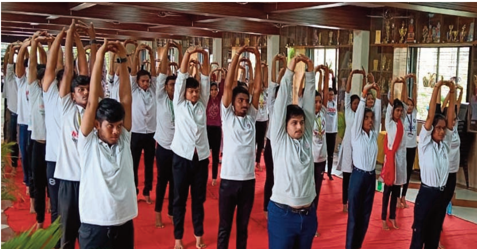
Students engage in a focused yoga session as part of the International Yoga Day celebration.

To mark International Yoga Day on June 21st, SST College, in collaboration with the NSS Cell of Mumbai University, the NSS Unit of SST College, Arogya Yoga and Naturopathy Center, and Jeevan Foundation, organized a district-level yoga training workshop. The event was held with a focus on the theme of "Women Empowerment" and was attended by NSS volunteers from various