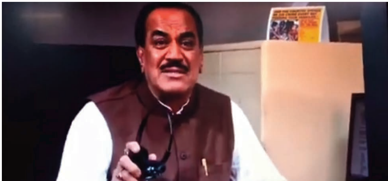
TV Fame Shivaji Satam Encourages Students to Know Their Consumer Rights & Motivates them to Make Informed Decisions.

In a significant step toward promoting consumer education, an online Consumer Awareness Program was organized in collaboration with the Consumer Guidance Society of India (CGSI) and the Telecom Regulatory Authority of India (TRAI). The program aimed to empower students by educating them about their consumer rights and responsibilities, along with the measures available to protect them against unfair practices.