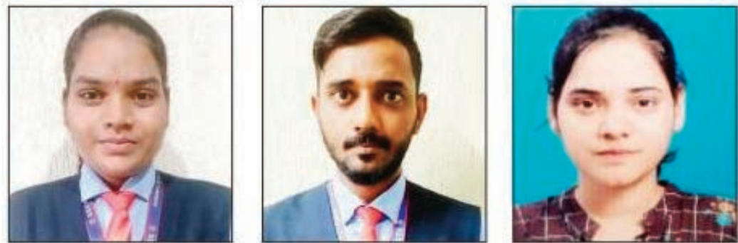
The shining stars of SST College who secured top positions in university exams.

Students of SST College have achieved outstanding success in the recent university examinations, reinforcing the institution's reputation for academic excellence. Renowned for their achievements in arts, sports, cultural, and social activities, the students have now added another feather to their cap with stellar academic performances.