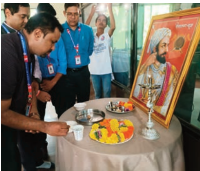
SST College officials honor Chhatrapati Shivaji Maharaj on Shiv Rajyabhishek Day.

The legacy of Chhatrapati Shivaji Maharaj is celebrated with deep respect and admiration worldwide, and his coronation day continues to inspire people with enthusiasm and pride. SST College joined the celebrations by marking Shiv Rajyabhishek Day with great reverence.