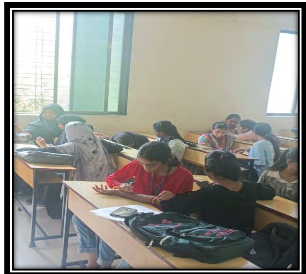
Students participating in Mehndi & Nail Art Competition