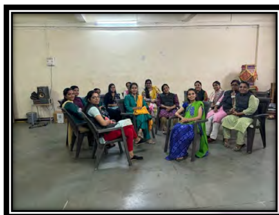
Faculty members at the celebration