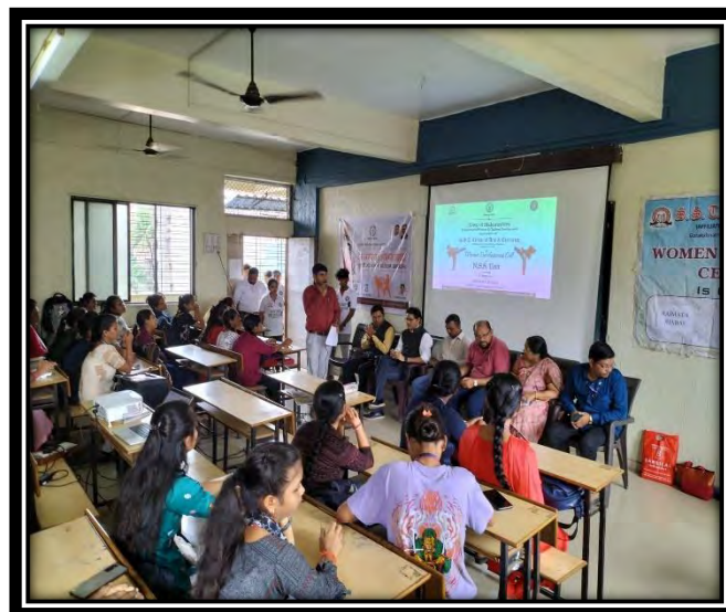
Students while attending the Self Defense session