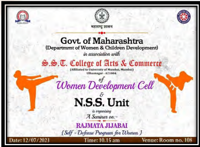
Banner for the event