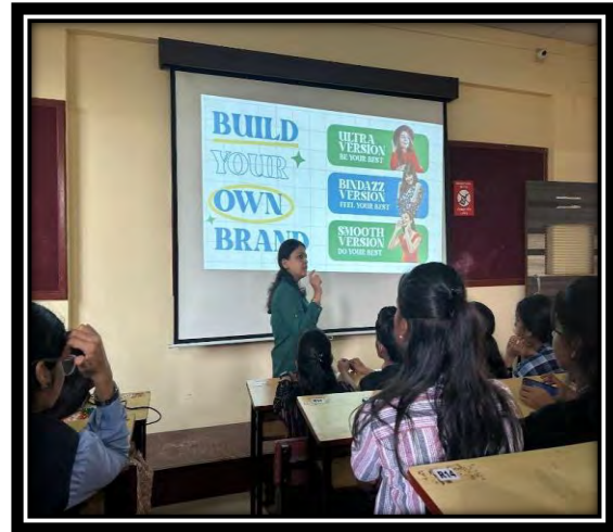
Team WDC with Resource Person

Resource person sharing valuable insights on the topic