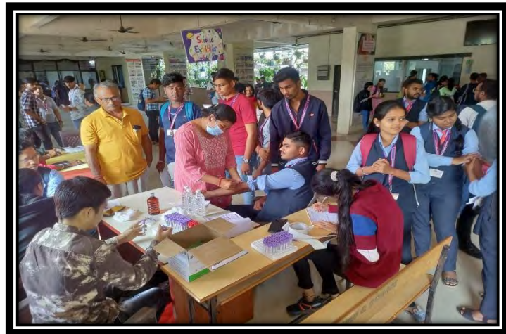
Students getting benefited Thalassemia checkup done