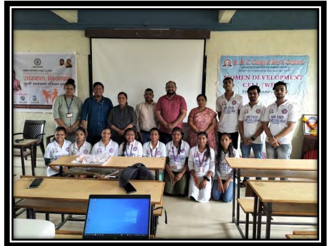
Rajmata Jijabai Team with students