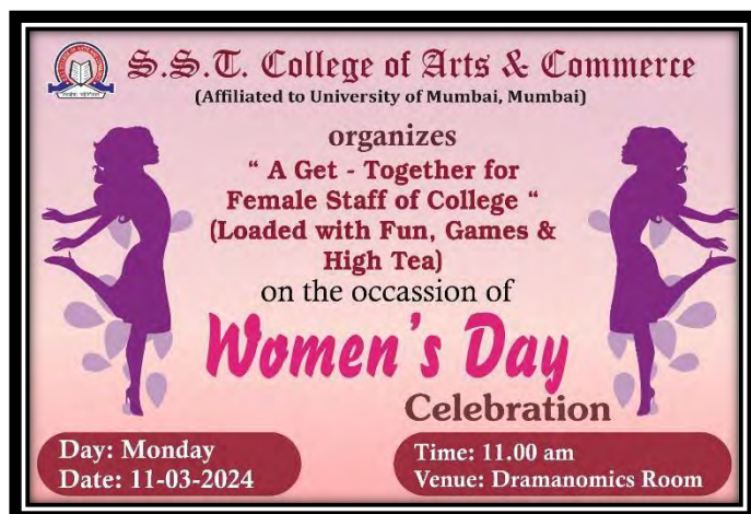
Banner of the Event