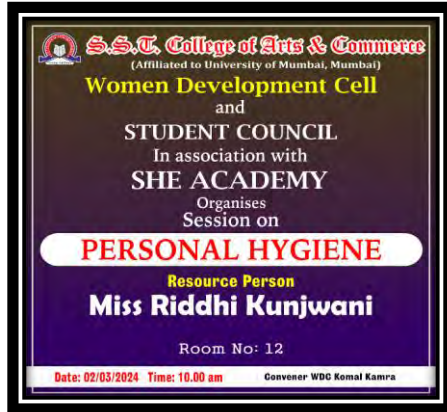
Banner of the Seminar

Resource person sharing valuable insights on the topic