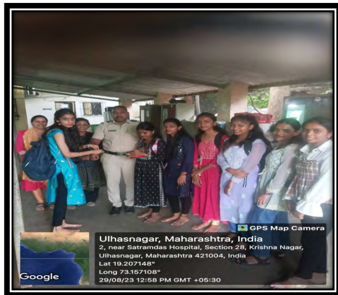
Team WDC with the students celebrating Rakshabandhan at Hill Line Police Station Ulhasnagar-5