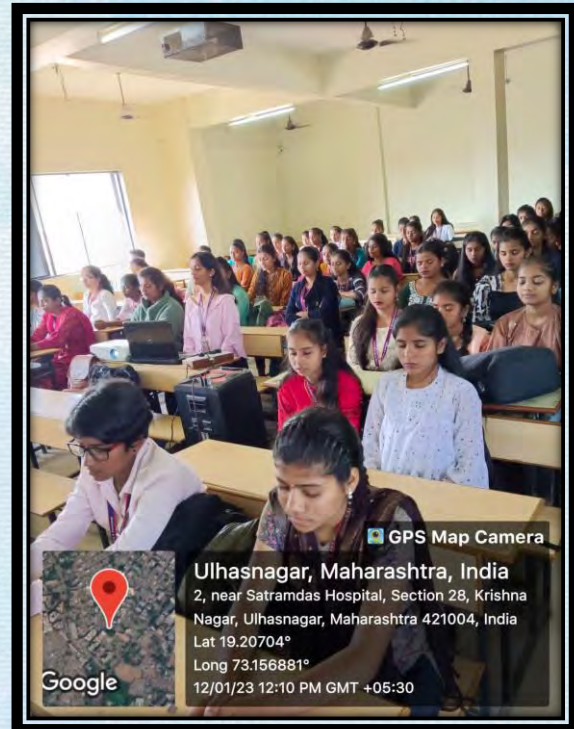
Students practicing Meditation