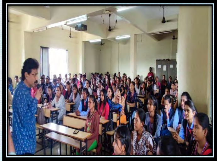
Banner of the Seminar attendees