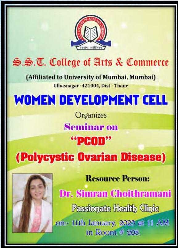
Banner of the seminar