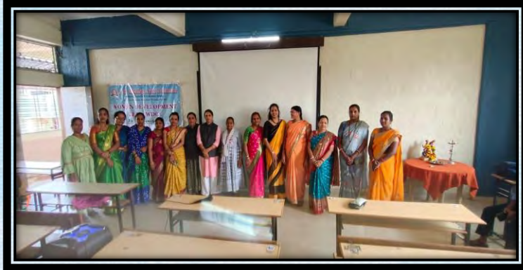
Mothers of girl students with the team members of Women Development Cell