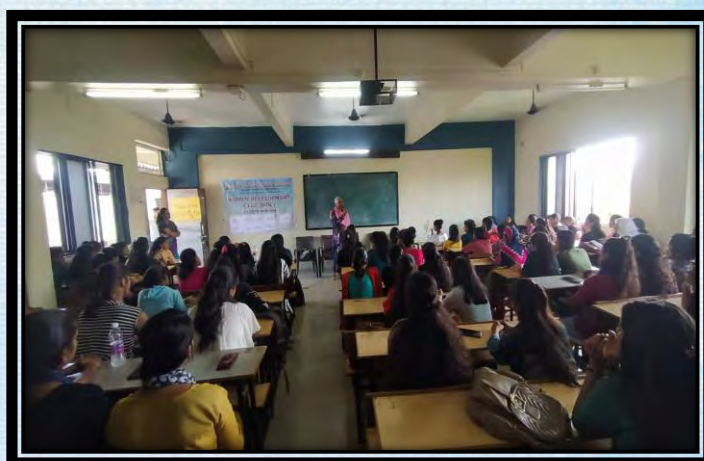
Banner of the Seminar with students