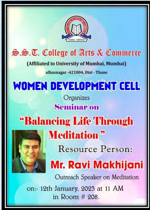
Banner of the seminar