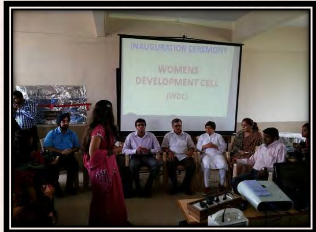
Student Volunteer of WDC offering vote of thanks