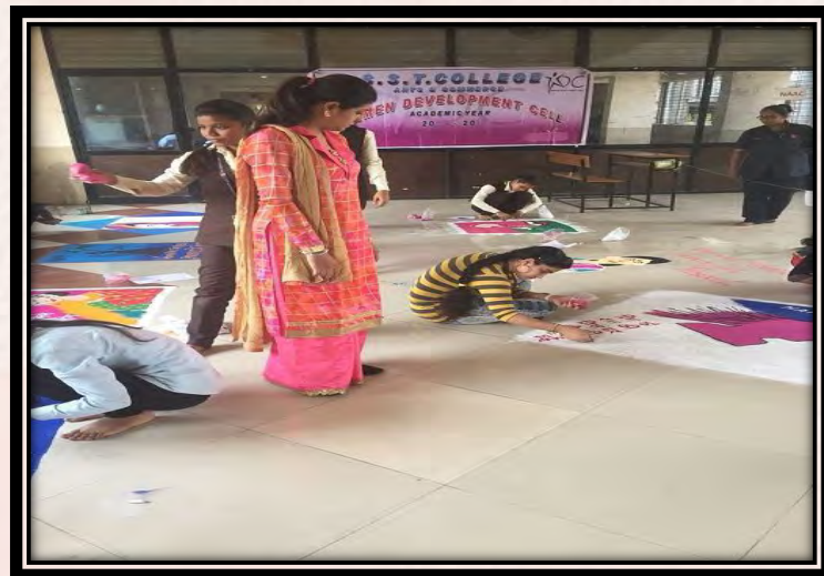
Students making Rangoli