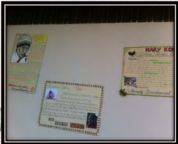
Award Winning Posters of Women Achievers