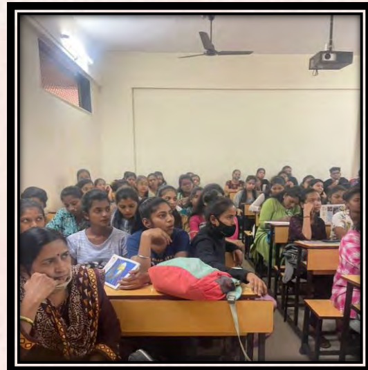
Students attending the Seminar on “Women Nutrition”