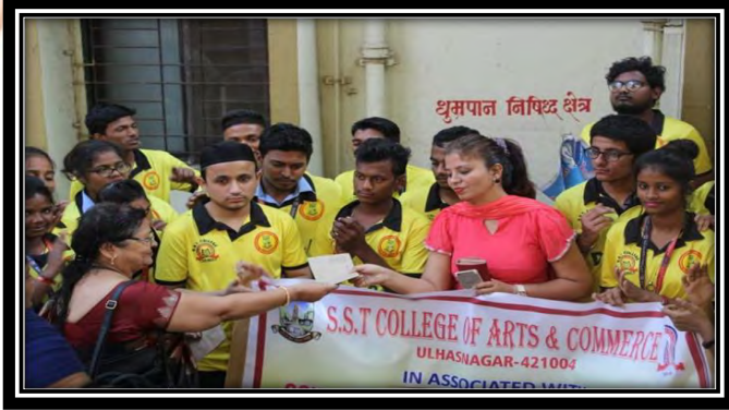
Receiving letter of appreciation from Hospital Management