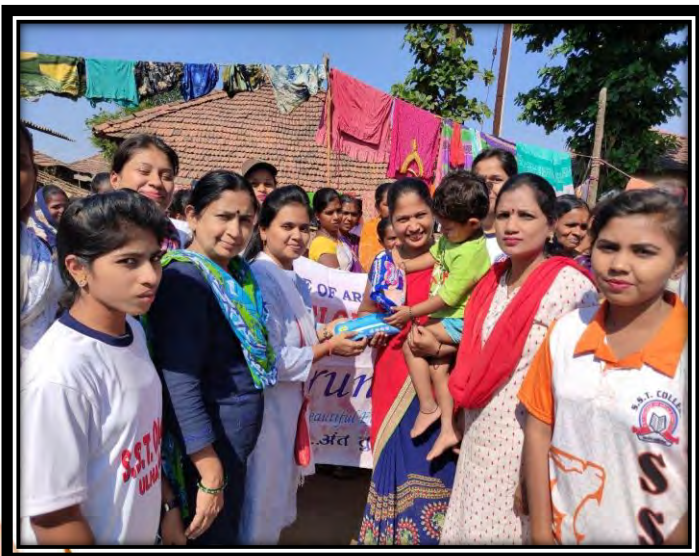
Distribution of Sanitary Napkins to tribal women