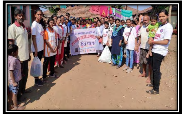
Women Development Cell along with the Volunteers and Tribal People of Dwarli