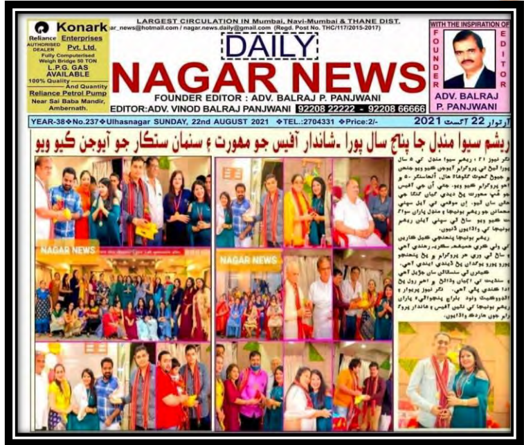
WDC & Resham Seva Mandal Food, Clothes & Books to Widows and needy students.