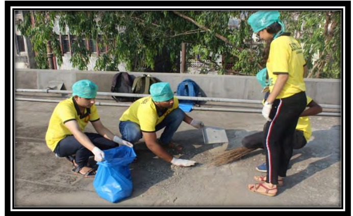
Cleaning done by our students as a part of Swachhata Abhiyaan