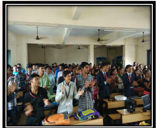
Students attending the seminar on Diabetes – Causes & Cures