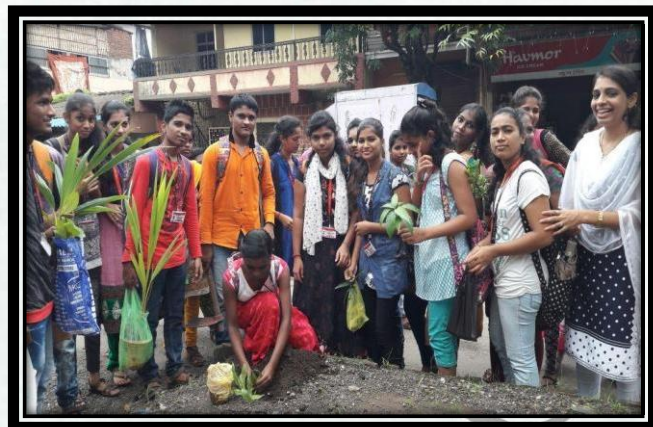
Students participating in a tree-planting campaign