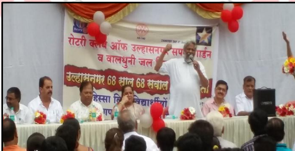
The Chief Guest address the students and sharing the experience