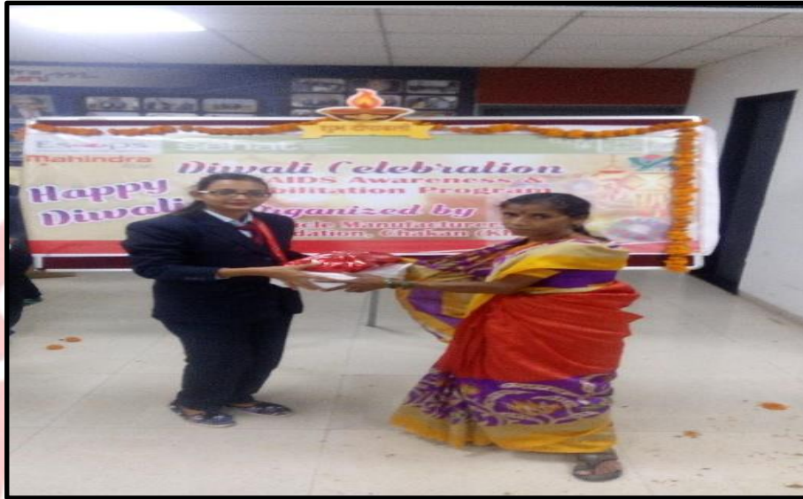
Sweets distributed to HIV Patient by DLLE Students