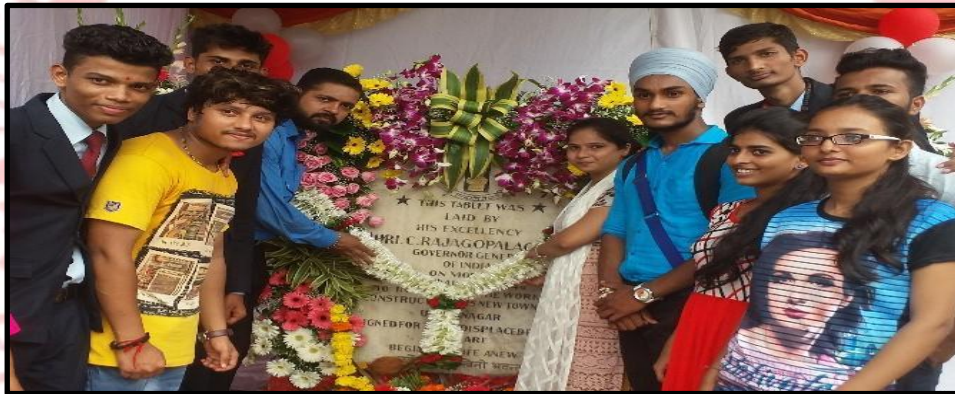
Students gathered at Ulhasnagar Foundation Stone