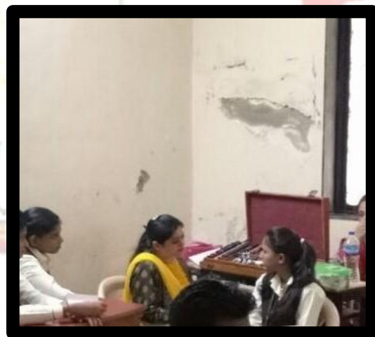
Doctors interacting with the students