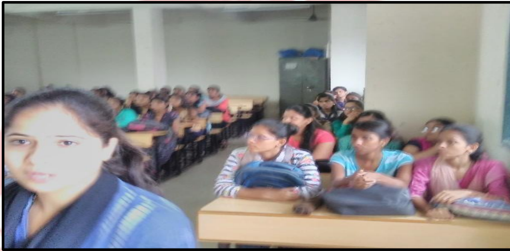
DLLE Convenor addressing the students