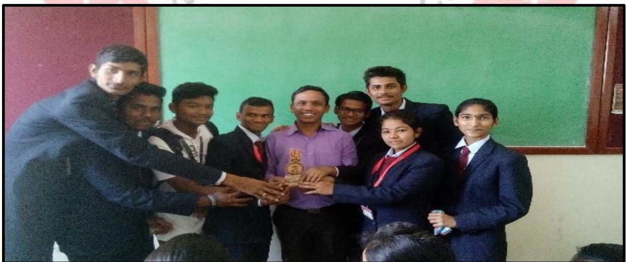
Students Sharing the Trophy with DLLE Extension Teacher