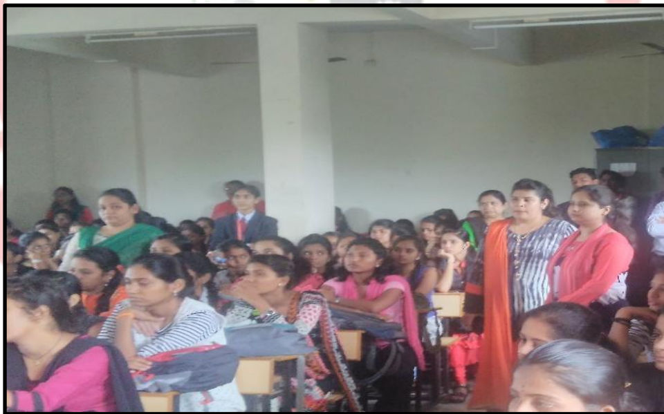
Students & Teachers Attending the Training of Second term Training Orientation.