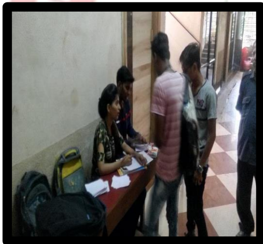
Students registering for skin care camp