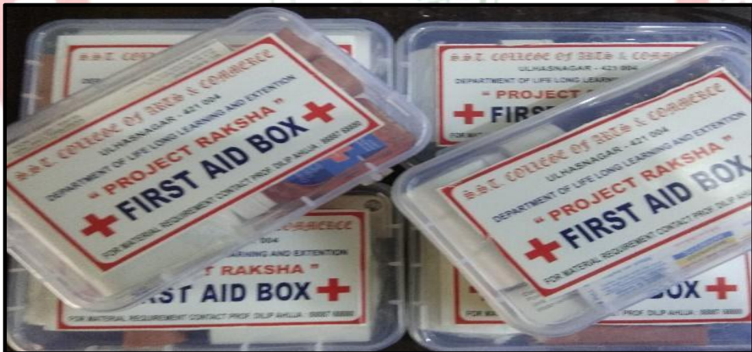
First Aid Boxes distributed at Project Raksha