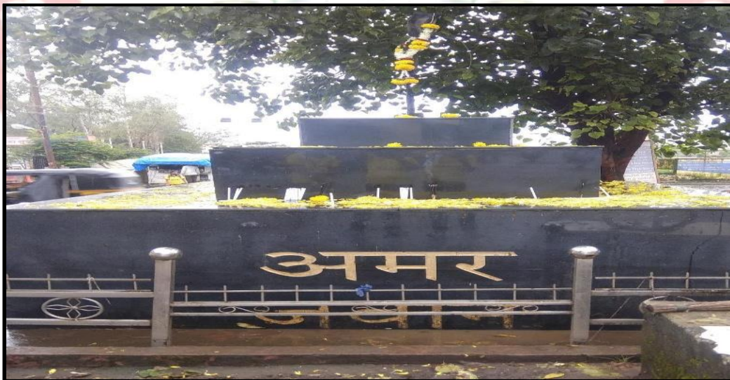
Decorated Amar Jawan Chowk by DLLE Students