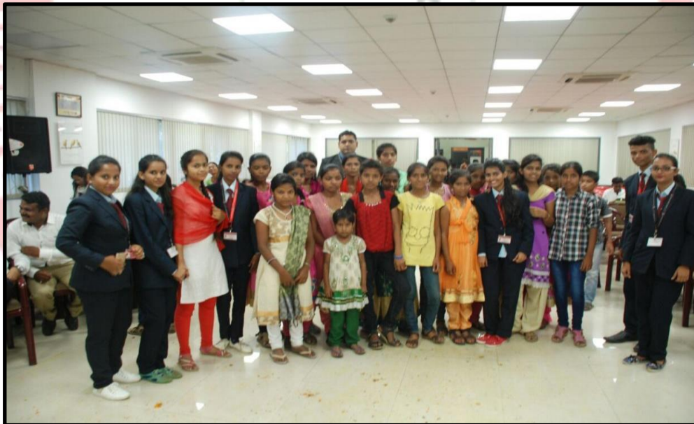
HIV Children Celebrating The Diwali festival with DLLE students & Mahindra HR Person