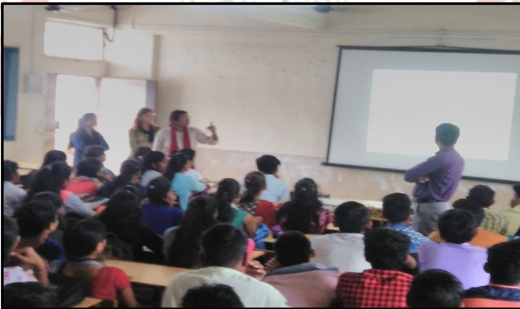
Students watching glimpses of last years DLLE projects