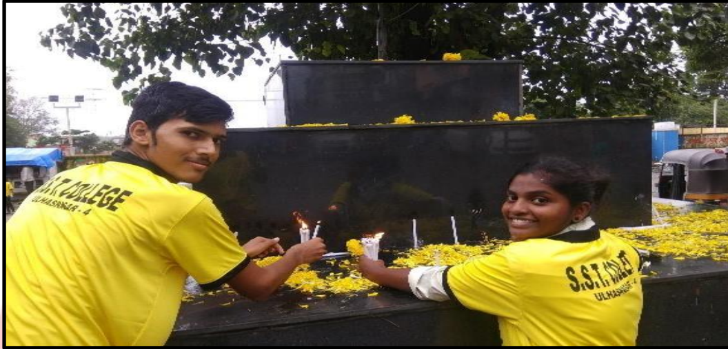
Lightning the candle By DLLE students at Amar Jawan Chowk