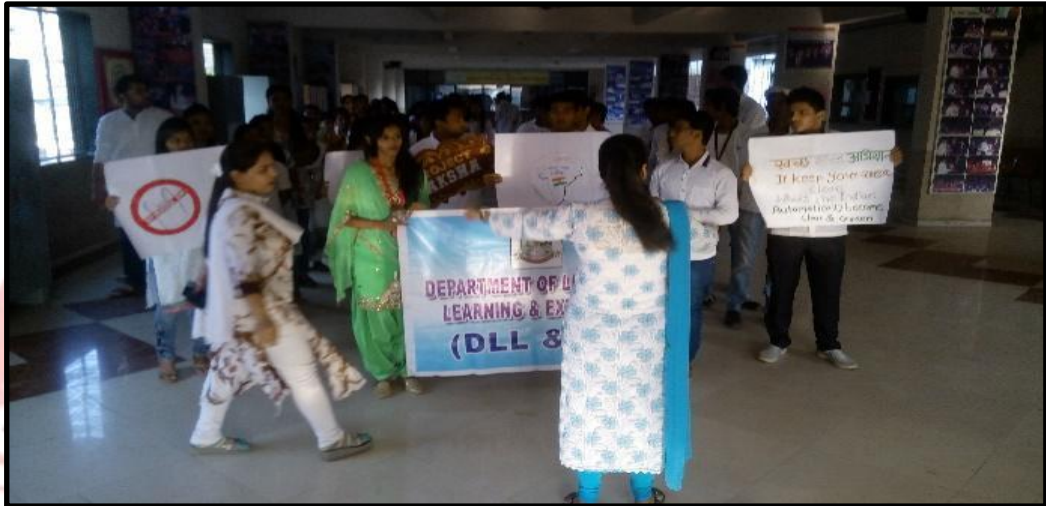
Rally Started From College Campus