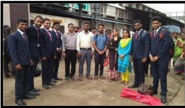
Students at Parle Food Ltd