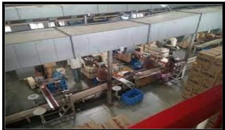
Students observing the manufacturing Unit