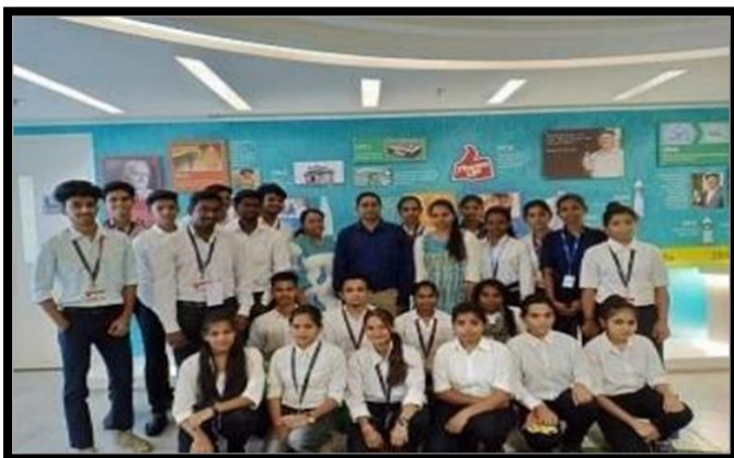
Students in Bisleri International