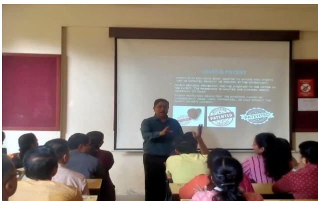
Resource Person Interacting with the Faculty Members