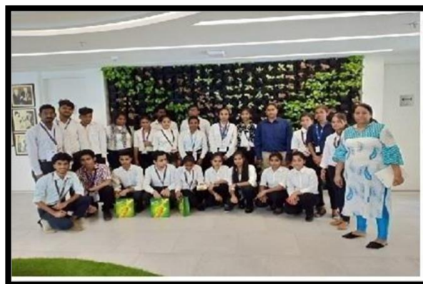
Students in Bisleri International with the resource person