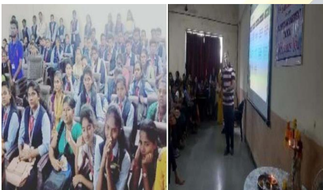
Resource Person interacting with the Students.