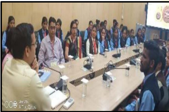
Students and Resource person at Session at Reserve Bank of India