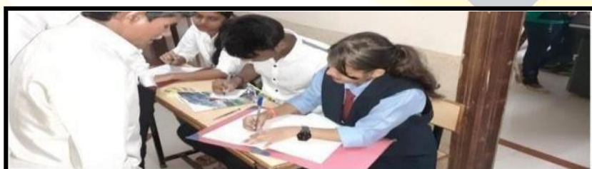
Students registering for the Health Check camp