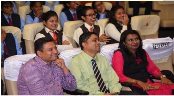
Students and Faculty at the NSE Session.