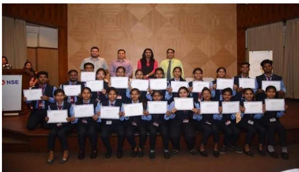
Students and Staff at NSE auditorium