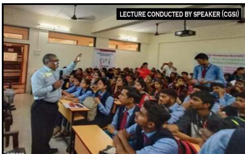
LECTURE CONDUCTED BY SPEAKER (CGSI)

Students attending the Session Conducted by CGSI