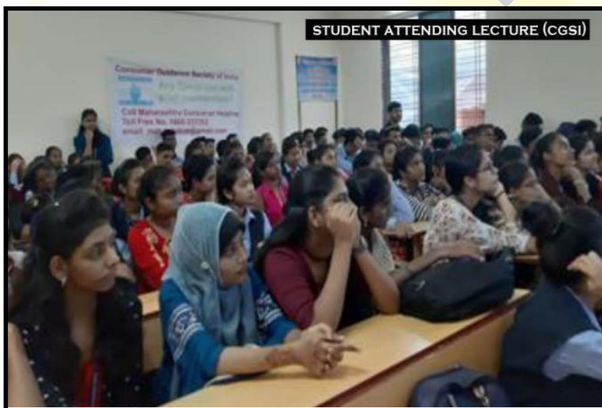
STUDENT ATTENDING LECTURE (CGSI)

Students attending the Session Conducted by CGSI