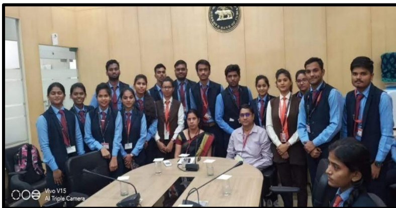
Students and Resource person after the completion of the Session at Reserve Bank of India