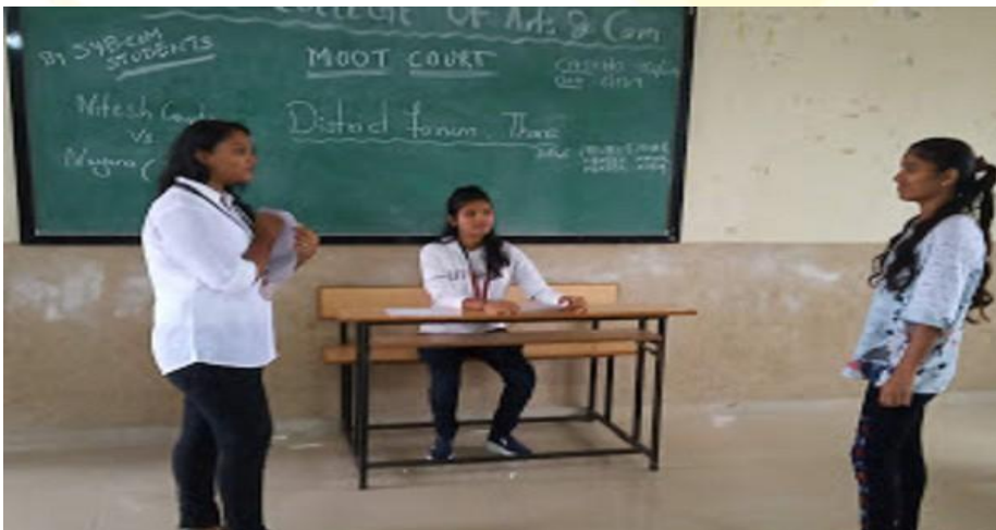
Students at the Moot Court Skit Play