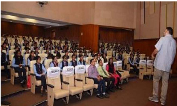
Students received the Participation certificate students