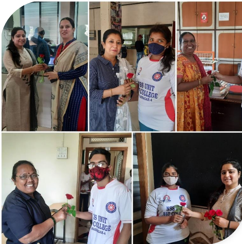
NSS volunteers giving roses to college female faculty