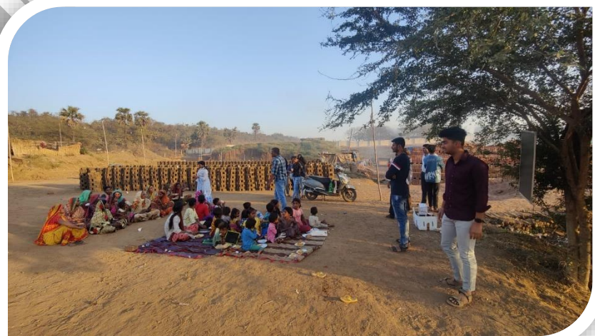
NSS volunteers educating Dropout Students from slum area