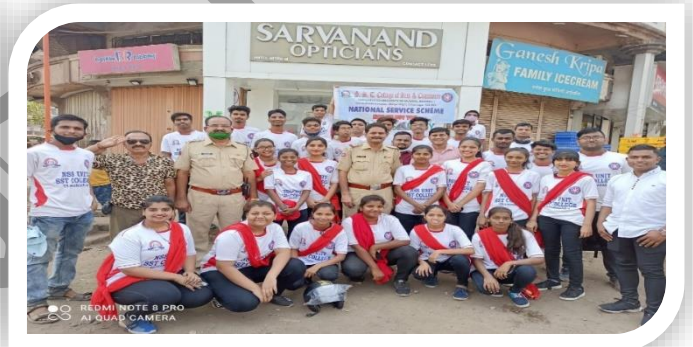
NSS volunteers performing Flash Mob on road safety