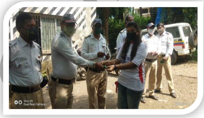
Mask prepared and distributed by NSS volunteers