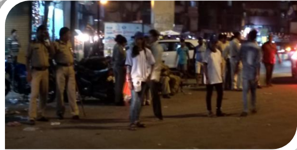
NSS volunteers helping traffic police