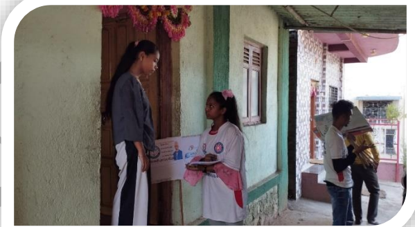
NSS Volunteers awaring people about Pradhan Mantri Jan-Dhan Yojana