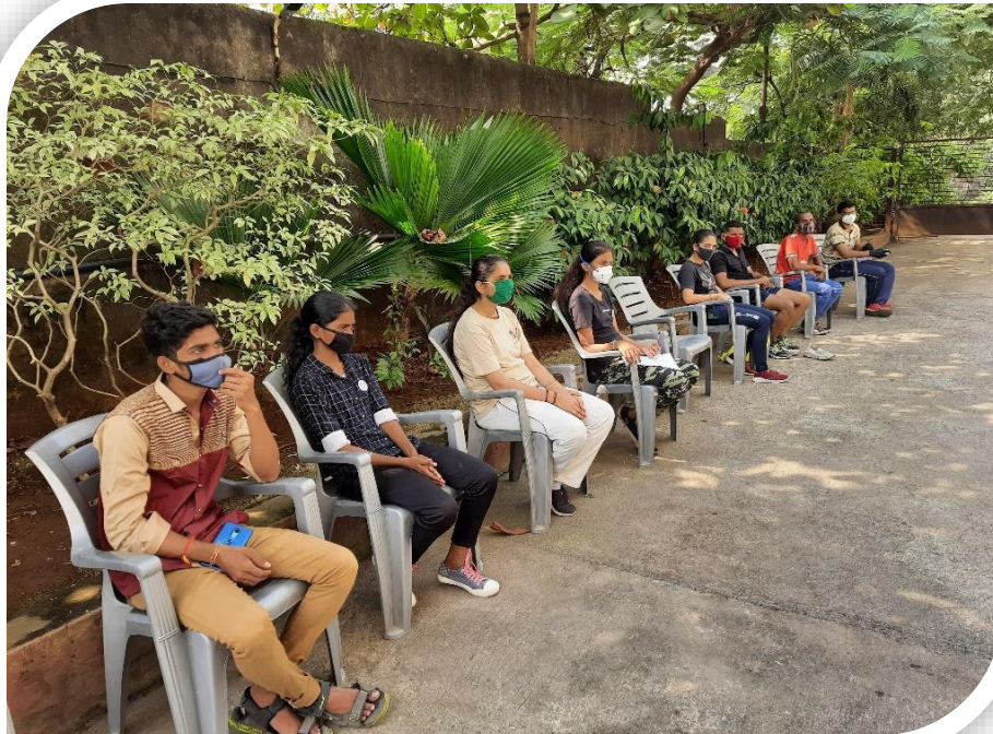
NSS volunteers @ Area Level Pre SRD and NRD selection