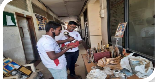
NSS volunteers cleaning college campus