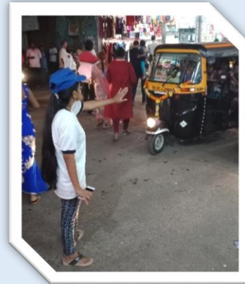
NSS Volunteers with Traffic police