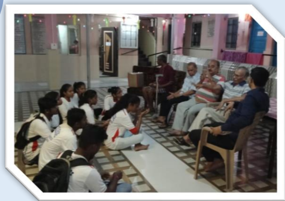
NSS Volunteers interacting with Sr. Citizen