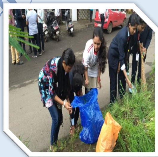
NSS volunteers cleaning SST College campus