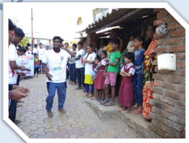
Volunteers performing Street play