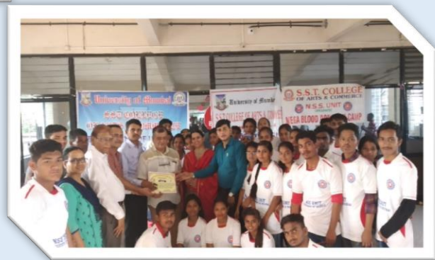
Donors & NSS Volunteers @ Blood Donation Drive