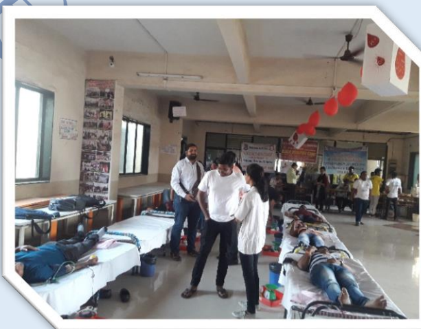
Volunteers & Donors @ Blood Donation Camp