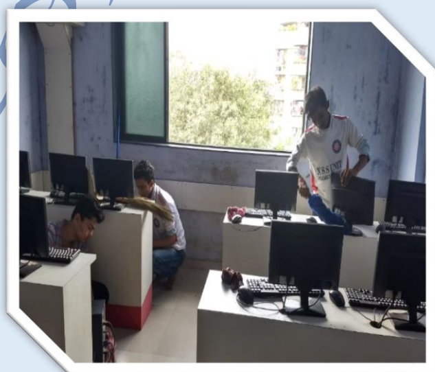
NSS volunteers cleaning SST College campus