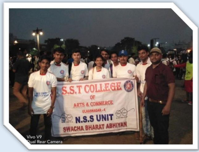
NSS Volunteers @ Gandhi Jayanti Celebration