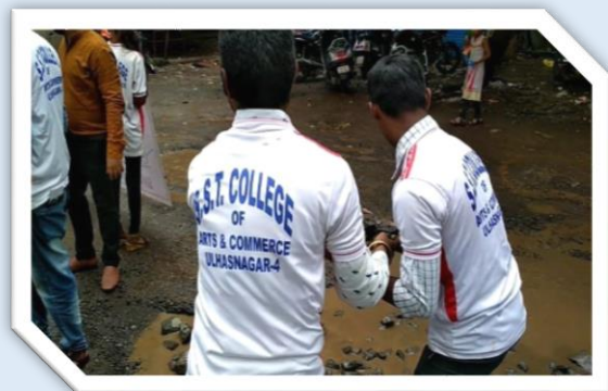
Volunteers helping to construct the road