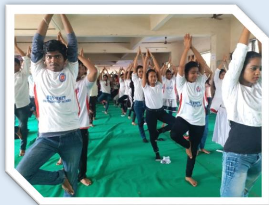
NSS Volunteers & Students performing Yogasana