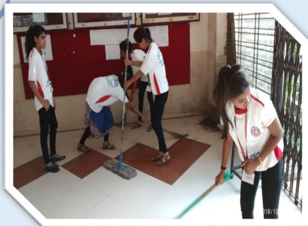
NSS volunteers cleaning SST College campus