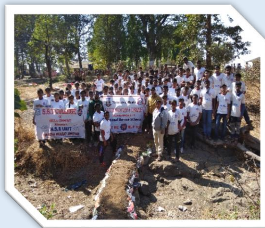
Volunteers built Forest Dam @ adopted village