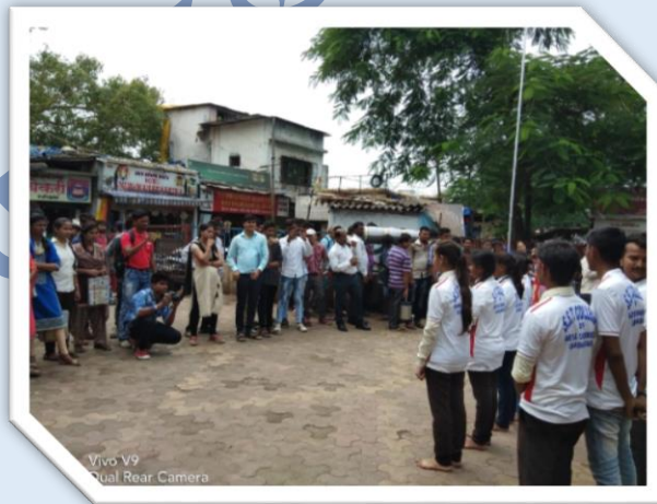
Volunteers performing Street play

By combining entertainment with education, the street play successfully captivated the attention of the audience, leaving a lasting impact on their minds. The volunteers' enthusiastic performances motivated individuals to take responsibility for their surroundings and actively contribute to a cleaner and healthier environment.