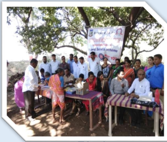
Volunteers @ Camp