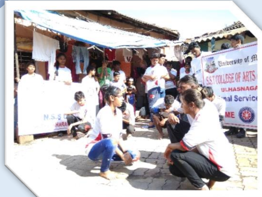
Volunteers performing street play