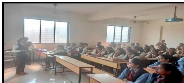
(TY Students addressing audience on Scams which was happened in India)