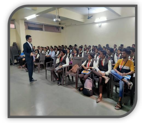
Glimpses of Employability Training