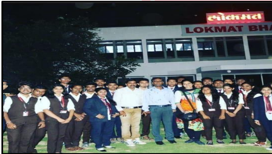
Students and faculty members along with Sr.Manager at Lokmat Printing Press

We would like to very much thank the management and college authorities for giving us this type of opportunity and permission to organize such a valuable students' career making visit.