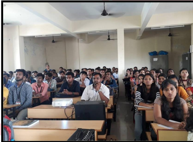
Students attending orientation session