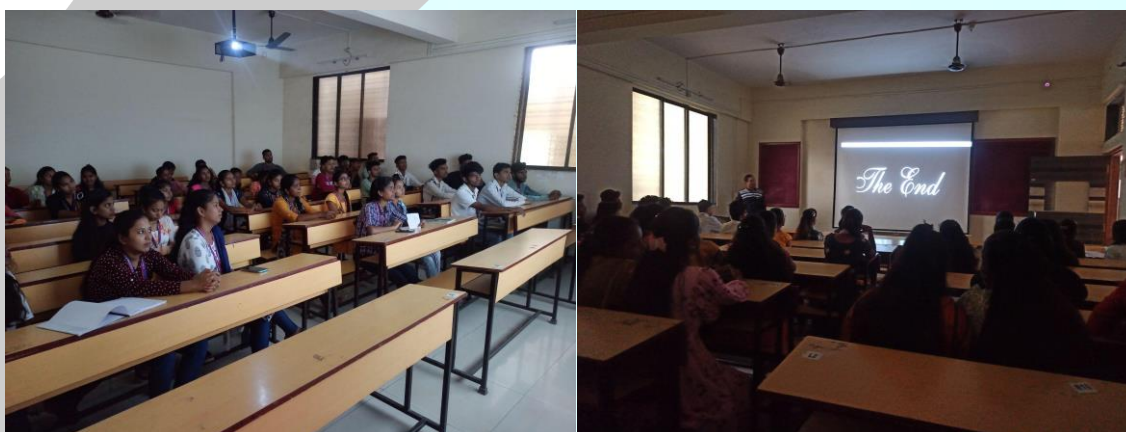
While the students are watching the Documentary