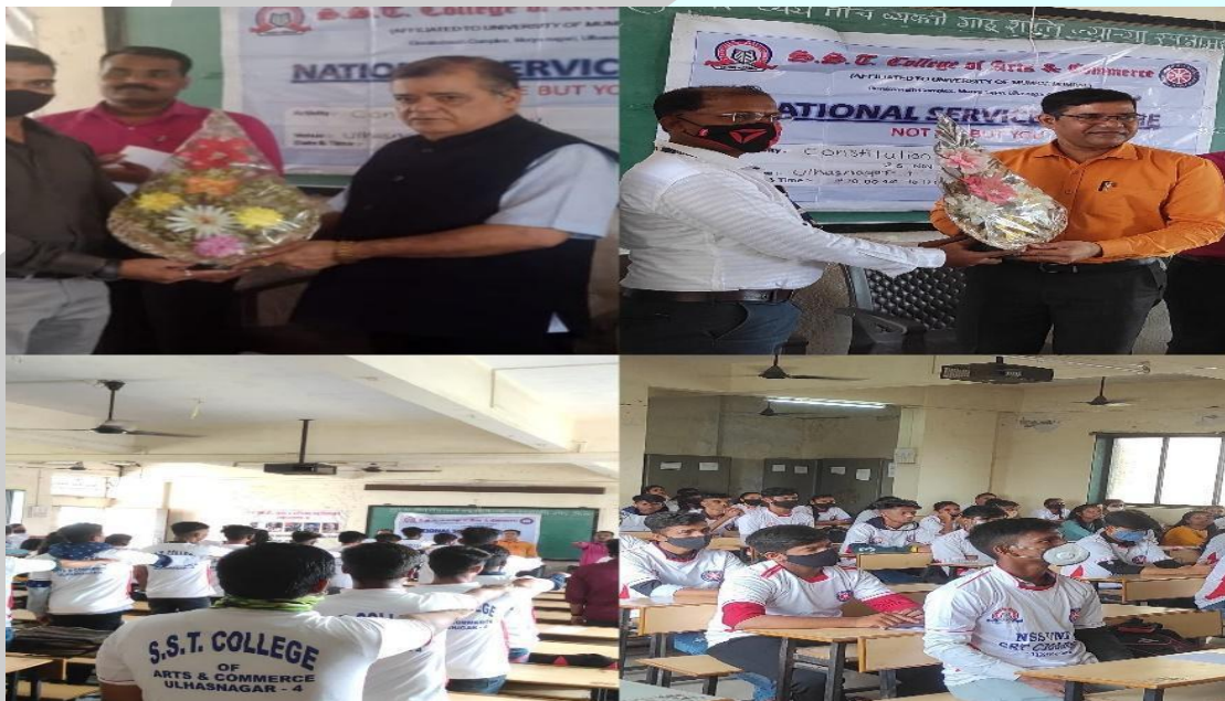
Some snapshots of the Constitution Day programme