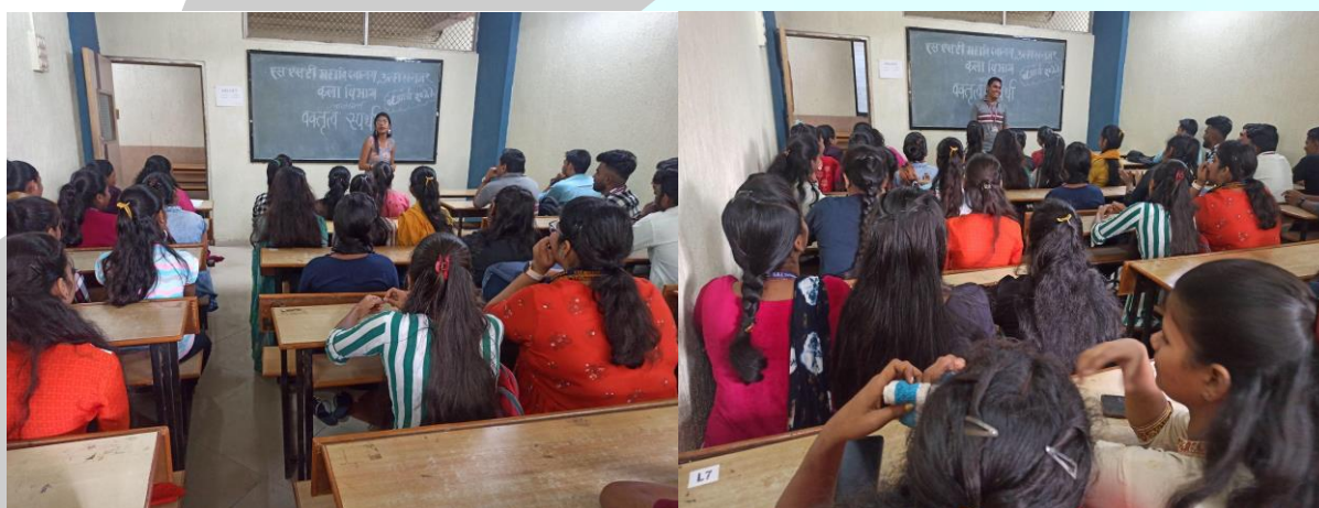
Participating students presenting their thoughts