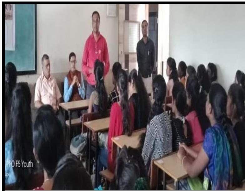
Information Delivering Session