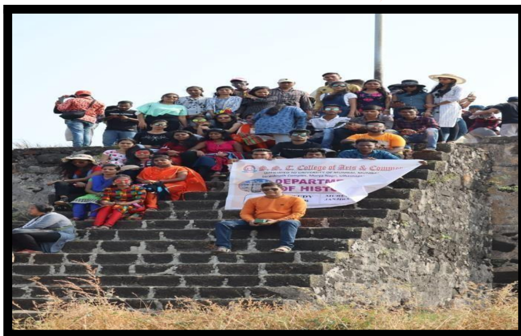
Students sitting on the Janjira Fort