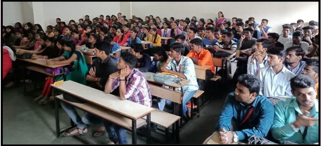
Students Attending the Session