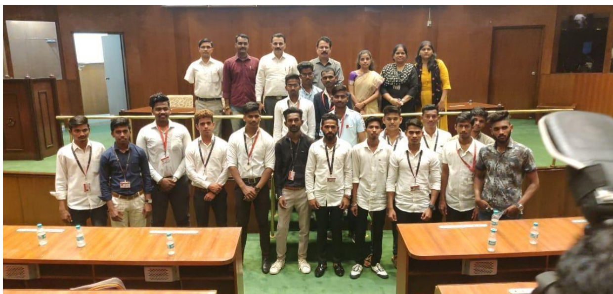
Students Present at Central Hall of State Legislature