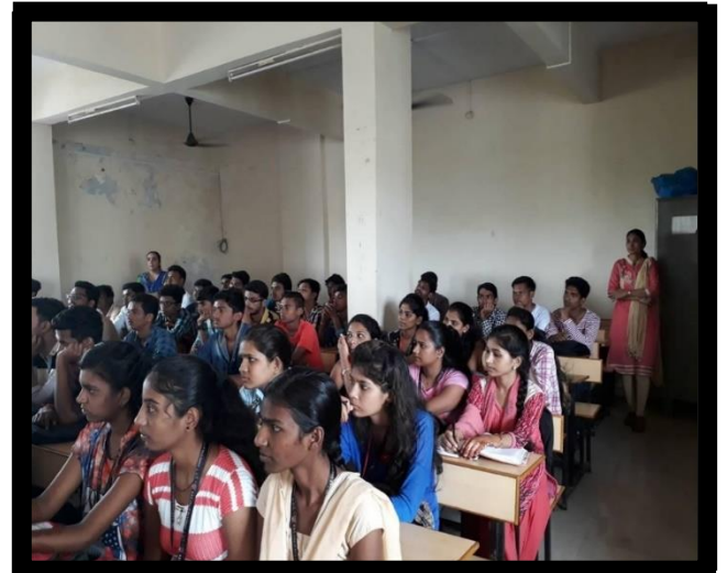
Students attending program