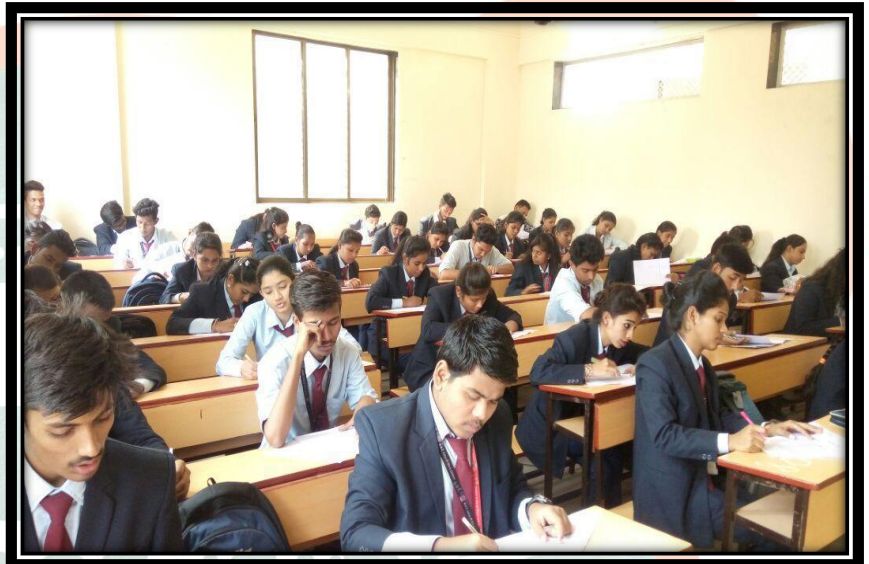
Students Working on Aptitude Testing