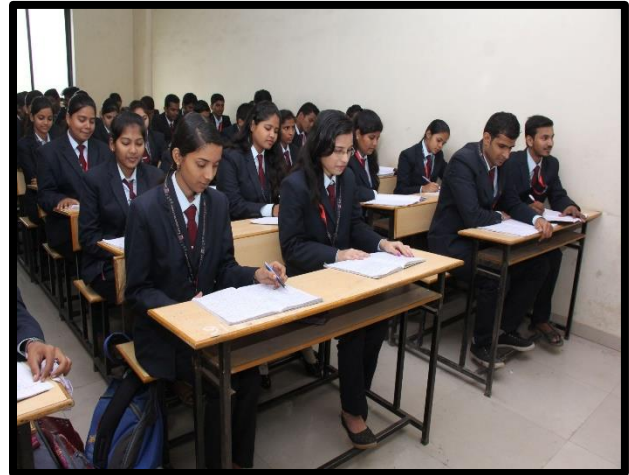
Students noting down the points during the Orientation Session