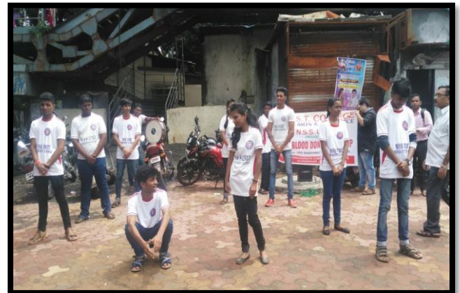
Photo of the Students participating in the Camp