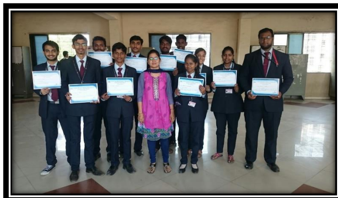
PHOTO WITH THE BSE EXECUTIVE DR.