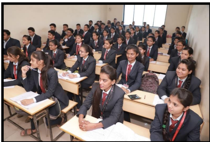
Students paying attention during the Orientation Session